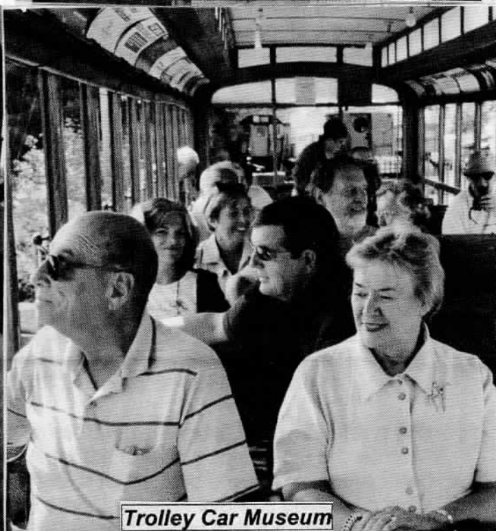
Trolley Car Museum