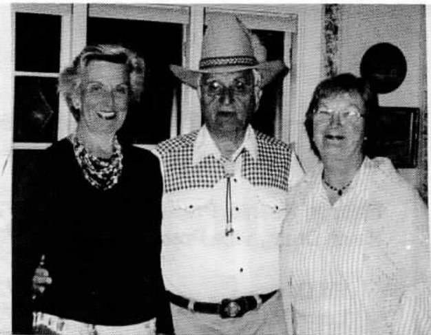
Texas Barbecue for 15th Anniversary Dinner