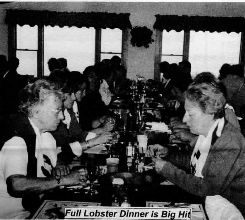
Full Lobster Dinner is Big Hit