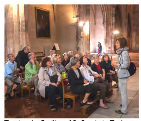
Touring the Basilica of St-Sernin in Toulouse.