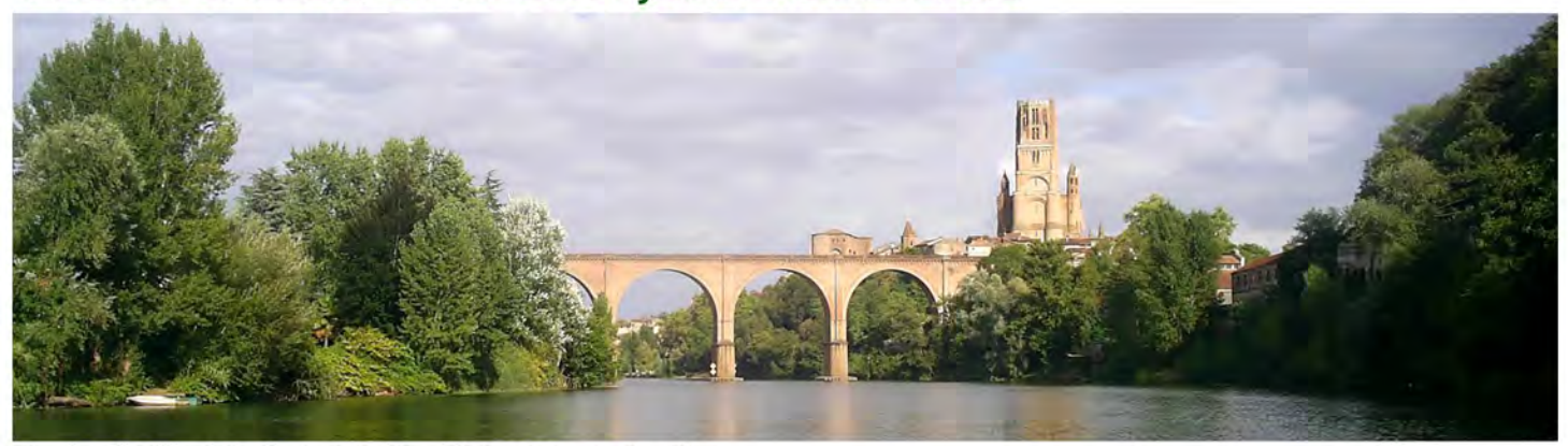
The city of Albi and the Cathedral of Ste-Cécile above the Tarn River.