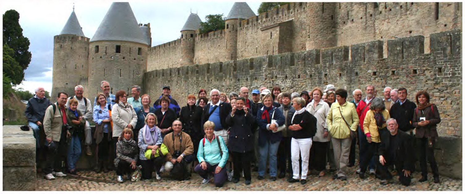
Many of the 58 French and American participants in the 2012 Winchester Jumelage French tour pose outside the walls of medieval Carcassonne.

January 2013 / www.jumelage.org / PO Box 453, Winchester MA 01890 / Volume 22: No. 2