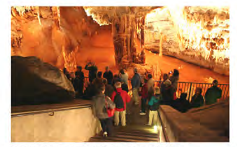
Descending into the Cabrespine Cavern.