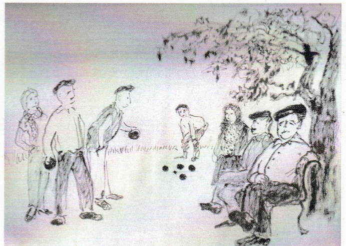
Petanque

We'll have balls and instructors at the park on June 12, 1:30 to 3:30 and families are invited.