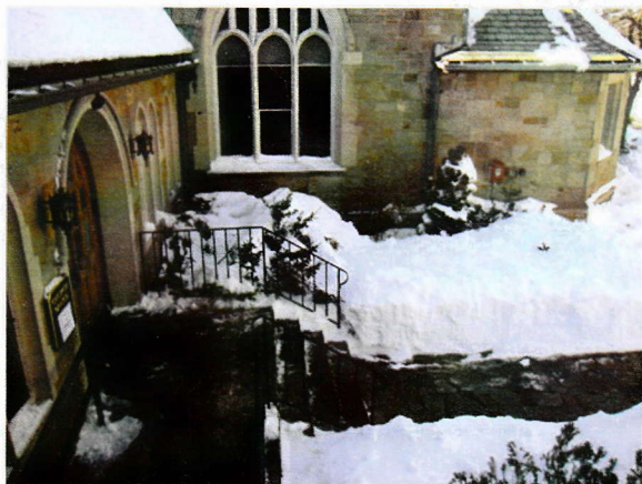
30" of snow, seen here at the entrance to Winchester Unitarian Church, had blanketed Winchester just a day before the concert.