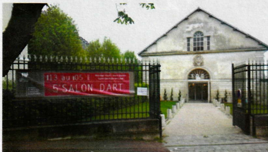
Entrance to the Manège Royal, site of the St-Germain Salon d'art.