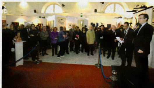
St-Germain Mayor Emmanuel Lamy welcomes the crowd on Opening Night.

The exhibition took place in the vaulted great hall of the historic Manège Royal, built by Louis XVIII in 1816 as a military training facility. A grand opening (vernissage), attended by over 400 people, was held on the evening of April 19th. Emmanuel Lamy, mayor of St-Germain, was among those addressing the crowd.