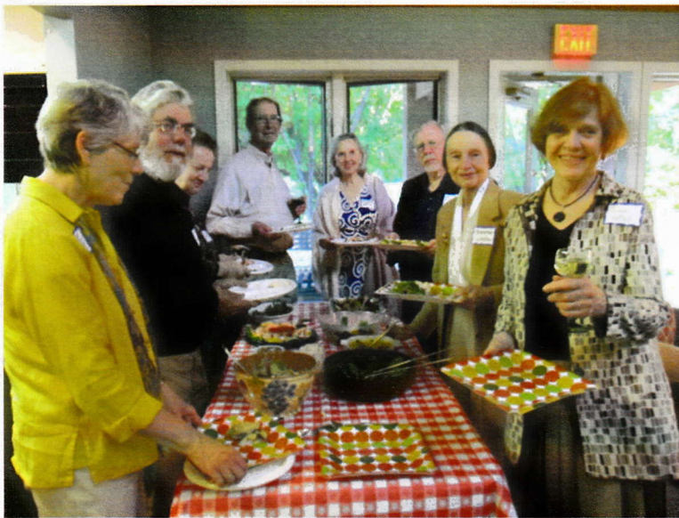
Attendees begin dining from some of the large selection of potluck delicacies shared at the most recent Taste of France.