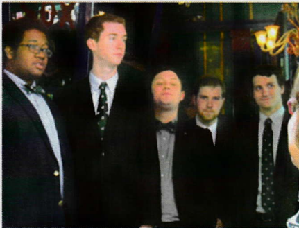
Brunch attendees were serenaded by the Krokodiloes, one of Harvard's a capella groups.