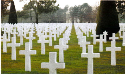
US Cemetery, Colleville-sur-mer.

Our Jumelage friends in St-Germain-en-Laye have just announced that the 2014 exchange trip will be to Normandy, coinciding with the observations surrounding the 70th anniversary of the D-Day invasion.