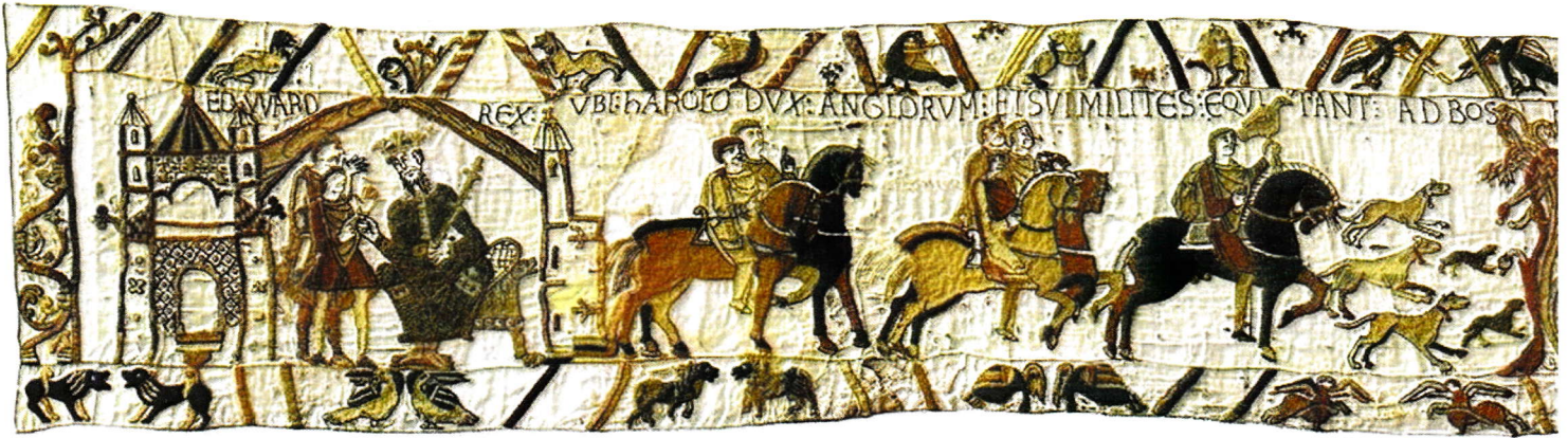
From the Bayeux Tapestry