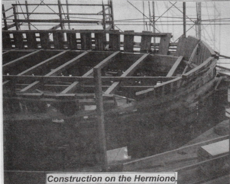
Construction on the Hermione.