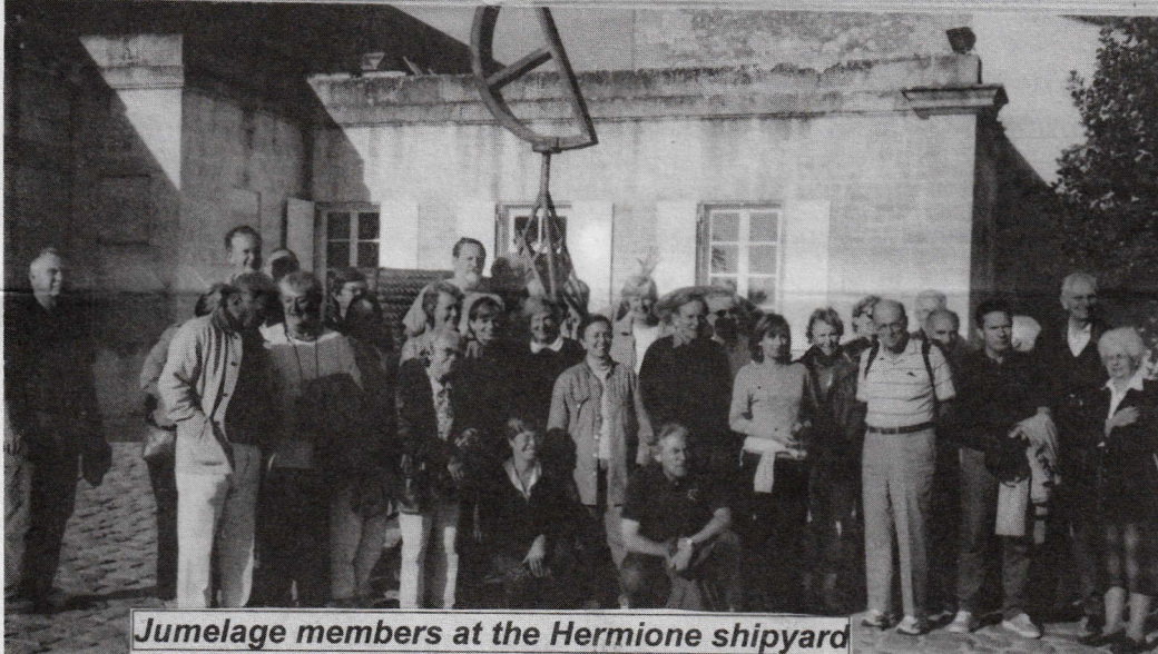
Jumelage members at the Hermione shipyard