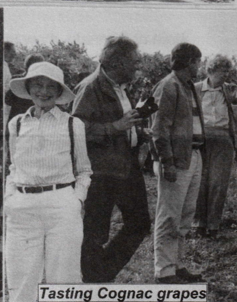
Tasting Cognac grapes