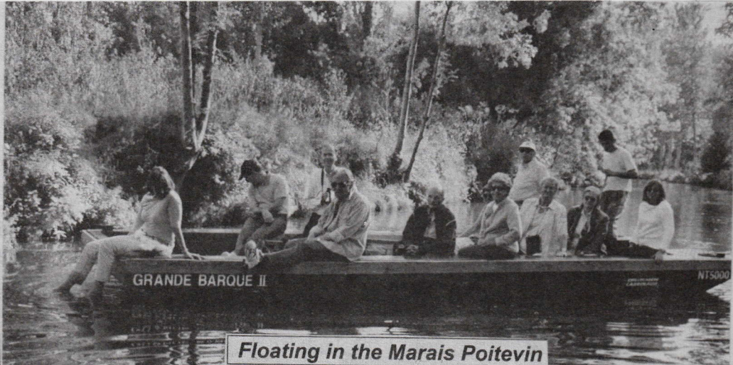
Floating in the Marais Poitevin