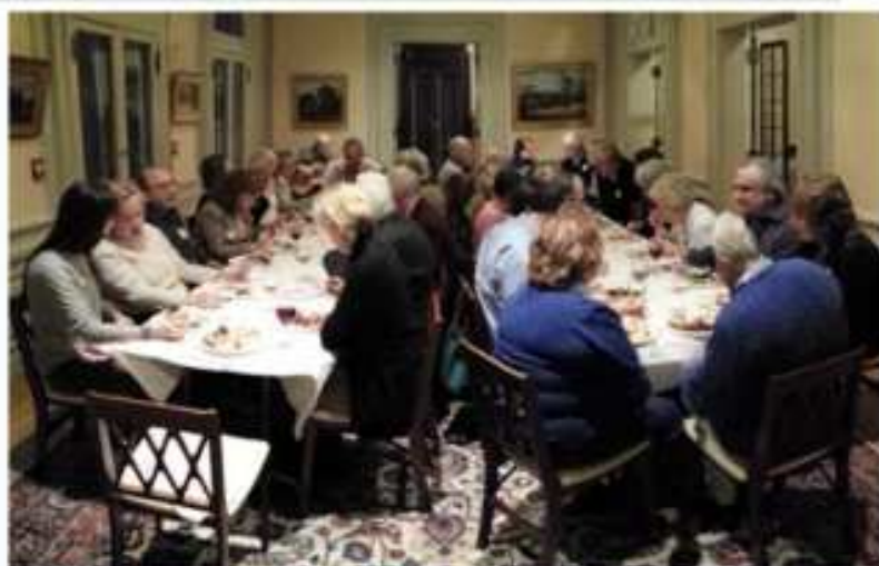
The Taste of France and the Annual Meeting were held concurrently this year, in the Sanborn House, the new preferred venue for Jumelage events.