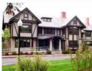
The 1913 Frank Fontaine Mansion, home of the Winchester Community Music School

For those seeking additional information about the two schools, the website for the French school is: