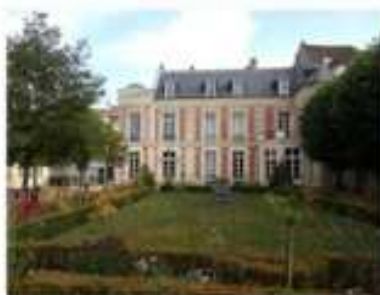
Hôtel Le Grand, in Saint-Germain-en-Laye, home of the Claude Debussy Departmental Conservatory.