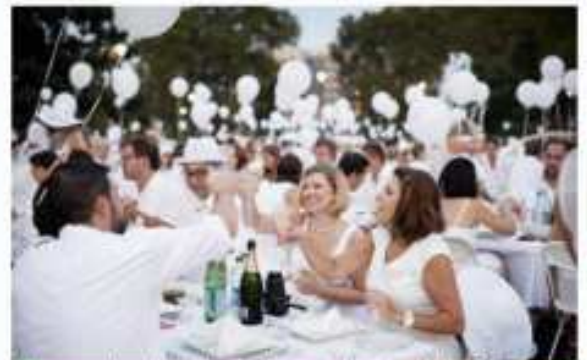
Dîner-en-blanc in Paris, outdoors at the foot of the Eiffel Tower