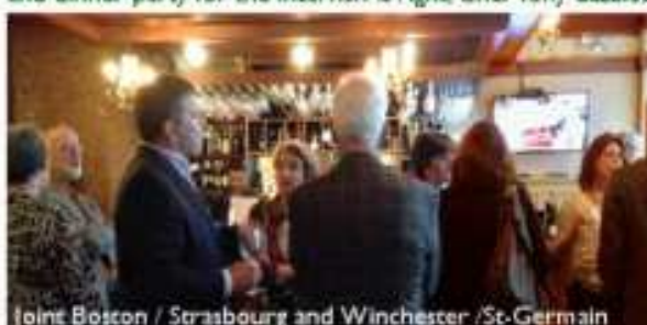
Joint Boston / Strasbourg and Winchester / St-Germain gathering at Sandrine in September to celebrate la Rentrée