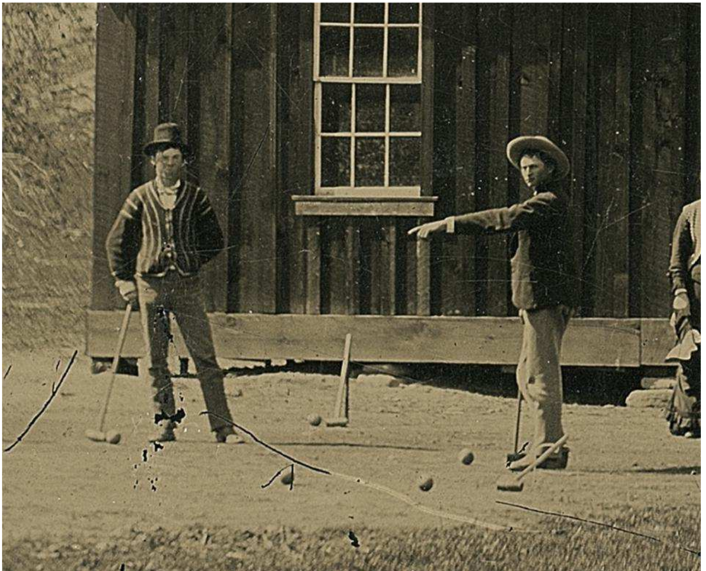
A detail of Billy the Kid (left) in the original tintype.

Le Far West a peut-être disparu depuis longtemps, mais il nous a laissé une flopée de personnages emblématiques qui restent incroyablement populaires jusqu'à nos jours. Les hommes de loi, les hors-la-loi, les hommes de la frontière, les pionniers, tous étaient le Far West. Là où l'Occident était bon, c'était de prendre un homme et d'en faire une légende !