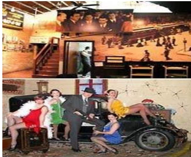
Tommy Gun's Garage